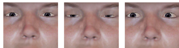
Figure 3: Face models used to evaluate eye motion.